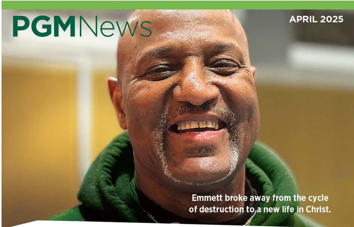
Emmett broke away from the cycle of destruction to a new life in Christ.