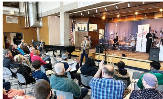
A live UNSHACKLED! recording at PGM

To all those who support PGM through donations and prayer, we extend our deepest gratitude for your unwavering support in our mission of meeting physical needs and sharing the Gospel. Your generosity fuels our efforts and inspires us to continue our work with renewed dedication and passion, knowing that through Christ, all things are possible.