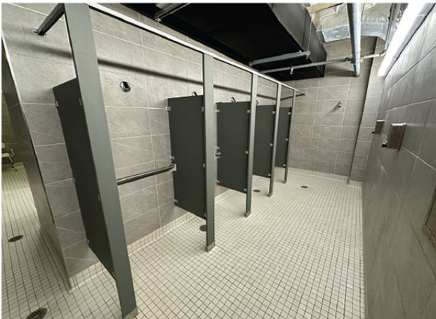
Newly renovated shower facility in the women and children's dormitory.

This renovation includes the installation of new flooring, partitions, tubs, and