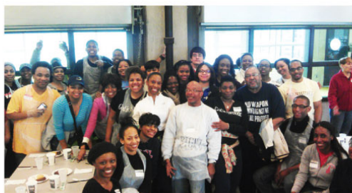
VOLUNTEERS: Thanks to all the volunteers who spent some of their spring break with PGM and a special thanks to those who helped serve our Easter dinner.